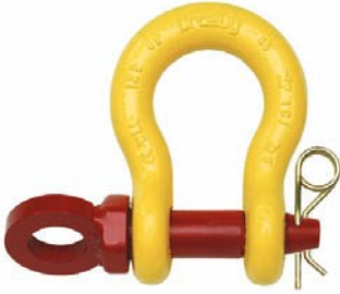
G209R ROV Shackle