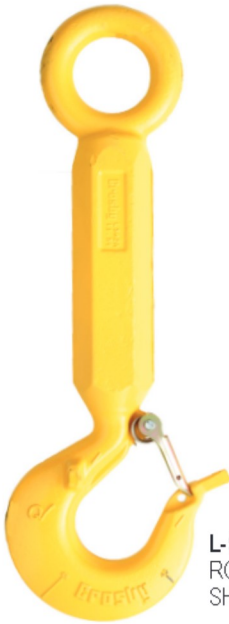
L-562A ROV EYE SHANK HOOK